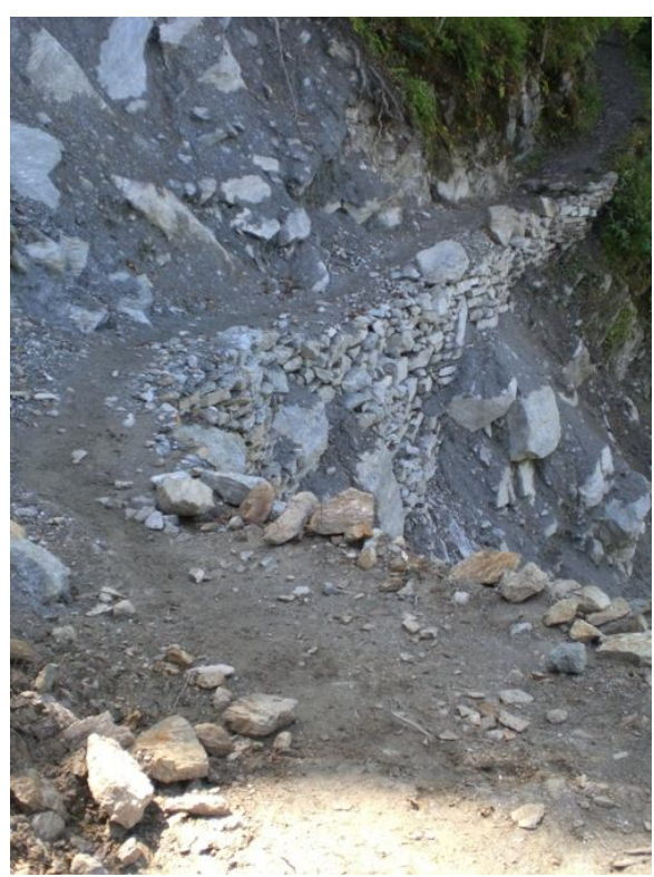
New way in Brabal