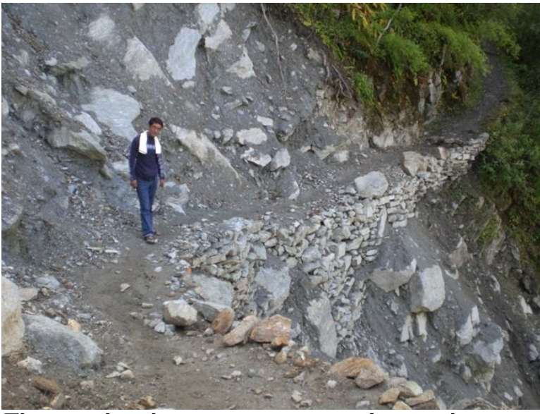
The way has been reconstructed stone by stone