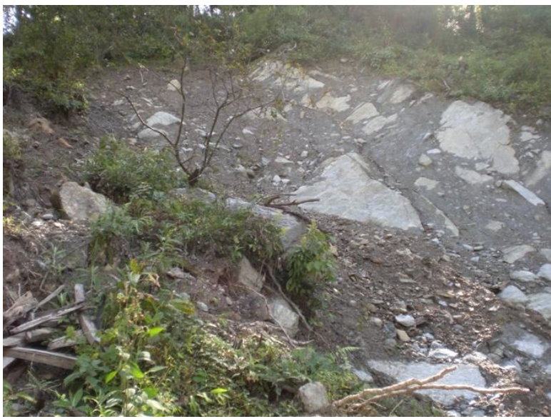
The landslide destroyed everything

According to our sustainability report dated 7th of October 2008, we donated a sum of NPR 15,000.00 on 22nd of September 2008 for the repair and the reconstruction of the way in Brabal. The way was destroyed by a landslide and no longer accessible.